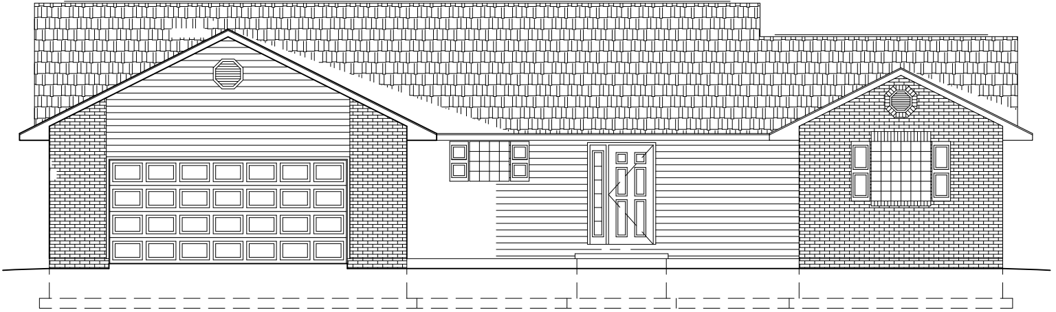
1 FRONT ELEVATION A-1